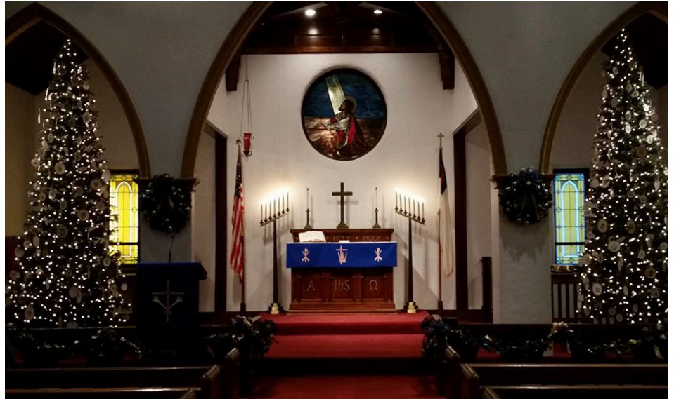
St. Luke Sanctuary - Christmas

The tradition of putting lights on Christmas trees symbolizes Christ as the light of the world. Legend has it that Martin Luther was walking towards his home one winter evening and was struck by the beauty of the stars shining through the evergreens. He brought a tree home and wired its branches with lighted candles to re-create the beauty he found in the woods that evening.