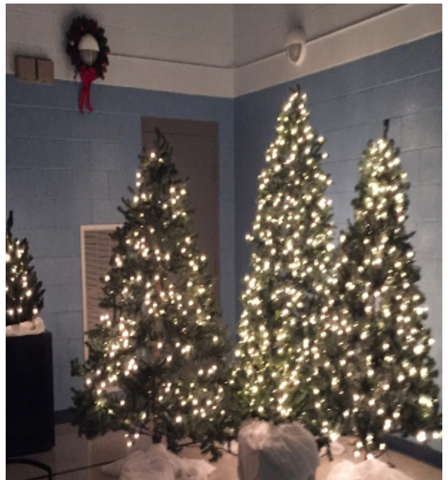
New Life Service