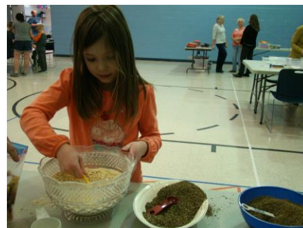
The students packed 200 bags of soup to be delivered to Katie's Kitchen and given to St. Luke Food Pantry.