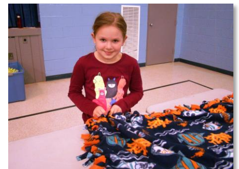
Madison tying 1 of 20 fleece blankets the students completed to be sent to Ronald McDonald House.